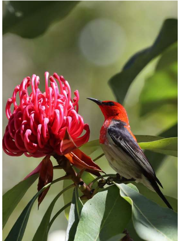
Male Scarlet Honeyeater by Chris Healey.

While the Scarlet Honeyeater population is considered stable across a large geographic range, they face significant threats. Logging and land clearing reduce availability of food and nesting sites, and agricultural expansion results in habitat loss, particularly impacting ground and understorey vegetation. With habitat changes, there is increased competition from larger more aggressive honeyeaters like the Red Wattlebird, Noisy Miner and Friarbirds, as well as predation by introduced species. Land clearing also fragments woodlands and disrupts connecting habitats, making it harder for birds to move between sites. The impact of a changing climate poses a longer-term risk to food and habitat security, with sharp declines in