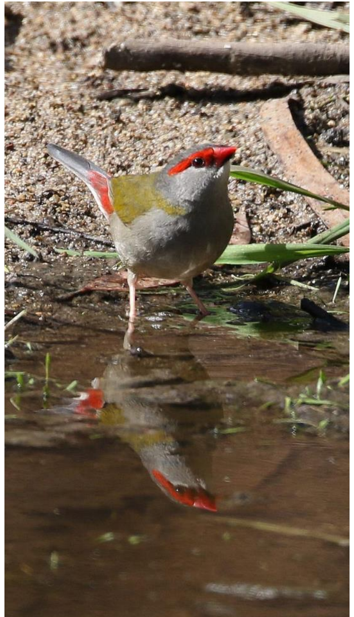
Red-Browed Finch

Treehouse Wildlife Refuge Metung, 0419 345 820 Birds, wombats, kangaroos, etc