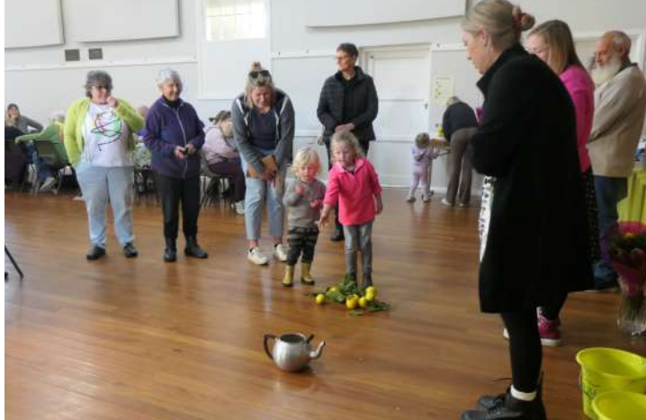
A huge turn out to enjoy Bruthen's Biggest Morning Tea with a selection of Coffee, Tea, Cakes, Big Bear's Donuts and Sandwiches.